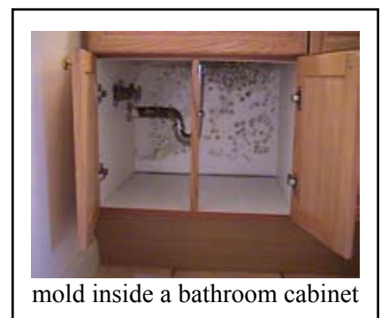
mold inside a bathroom cabinet